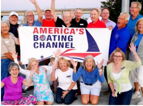
TLSPS Group ABChannel first night social/meeting