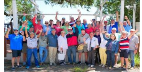
ABC Wrap at Sunbury Crab Company

and afternoon shooting began the next day, involving many of our squadron members and some guests, and continued through Saturday May 15 th culminating in a squadron cruise to Sunbury Crab Company for lunch. We were fortunate to be able to arrange assistance for the production of the videos from Savannah Boathouse Marina, Hogan's Marina, TowBoatUS, Chatham County Marine Patrol, Savannah Yacht Club, and River Supply.