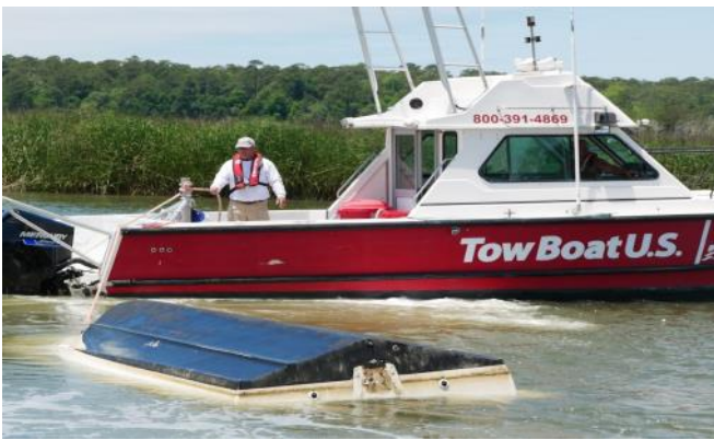
TowBoatU.S. and boat accident