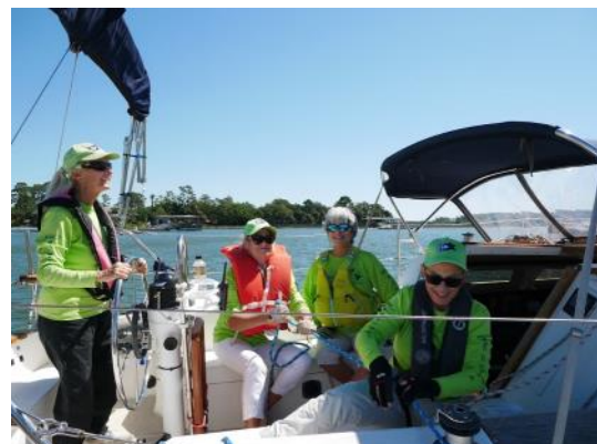
Women's sailboat crew