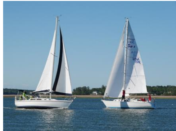
Sailboats - collision avoidance