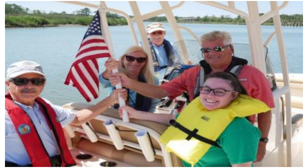
Cast raising the flag