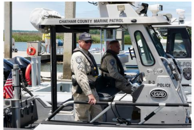
Chatham County Marine Patrol on scene